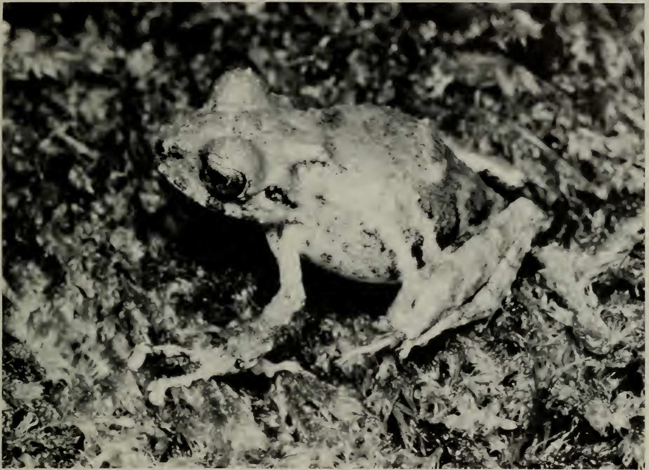
Fig. 1. Eleutherodactylus polymniae , new species, holotype, SVL 19.7 mm, UTA A-12976.

Variation. —The paratype (UTA A-23511) is similar to the holotype in most aspects of morphology, color, and pattern. Measurements for the paratype are as follows: SVL, 19.0 mm; head length, 7.9 mm; head width, 7.3 mm; horizontal distance across eye, 2.5 mm; eye to tip of snout, 3.4 mm; eye to nostril, 2.3 mm; horizontal distance across tympanum, 0.8 mm; tibia, 11.6 mm; and distance from proximal edge of inner metatarsal tubercle to distal tip of fourth toe, 9.5 mm.